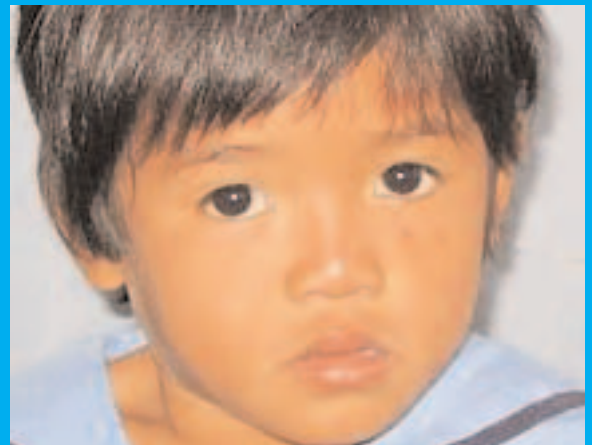
Example of Asia Pacific grant awarded 2007/08