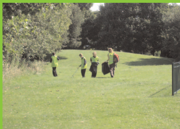
Example of UK & Republic of Ireland grant awarded 2007/08