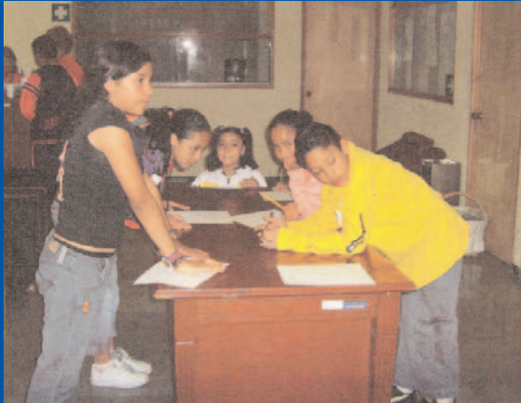
Example of Americas grant awarded 2007/08